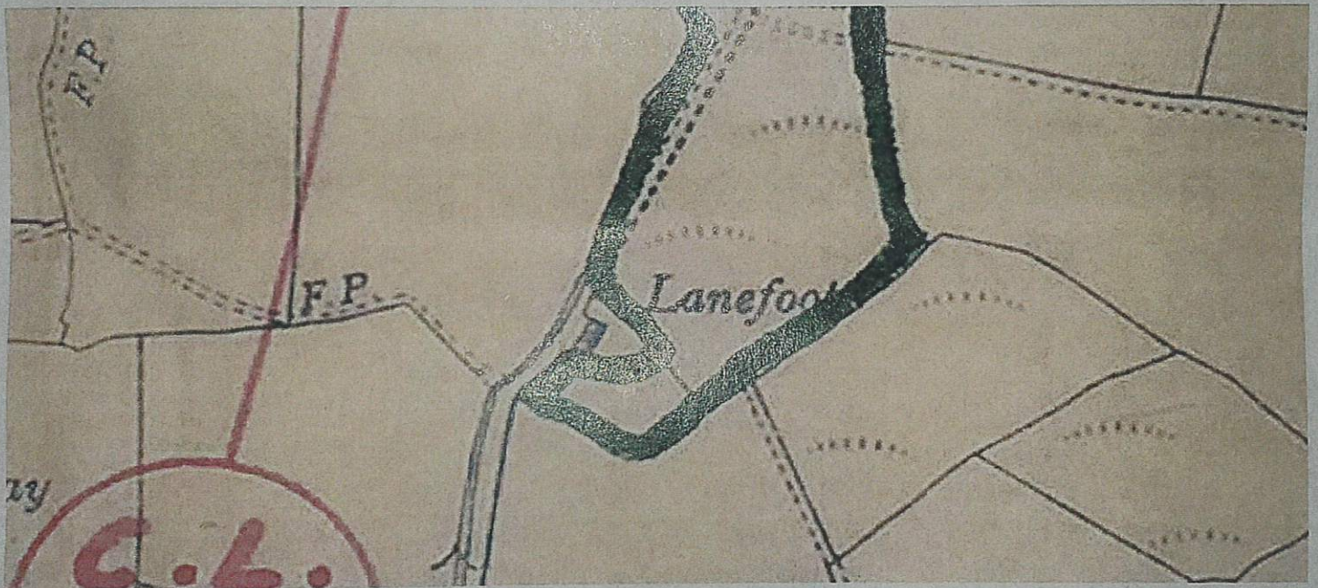
Current Register Map